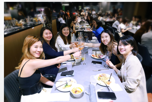
SG-WEN International Women's Day 2025 – Stream, Sell, Shine: Women Building the Future (In partnership with Shopee, FLY Entertainment, and Shiseido)