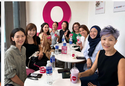
Entrepreneurs Circle: A peer support group for women entrepreneurs to network, exchange experiences, and elevate their businesses.