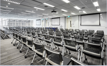
Combined seminar rooms (Theatre style, accommodates up to 150 pax)