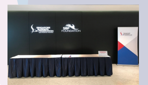
Dedicated registration area