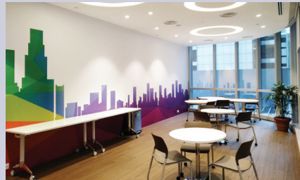
Breakout area for lunch, teabreak and networking sessions