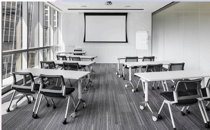
Training room (Classroom style, accommodates up to 16 pax)