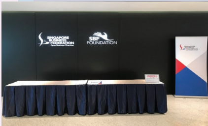
Dedicated registration area